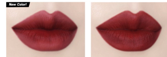
# ANTI-SOCIAL Brick Brown