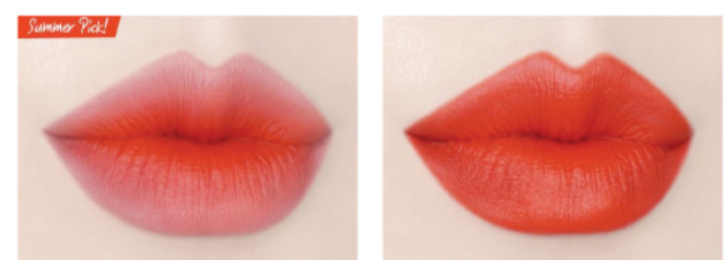
# TRUST ISSUE Red orange