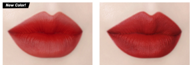
# WARM BLOOD chili red

"A little lonelier but better" type of deep taupes with a hint of red.