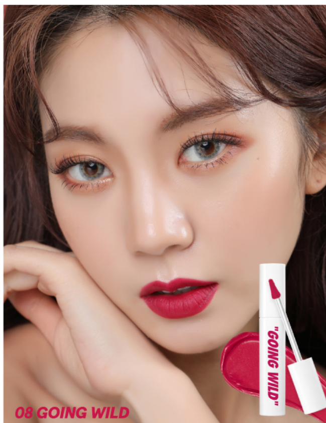
08 GOING WILD

Update your autumn lok with our favorite brick red.