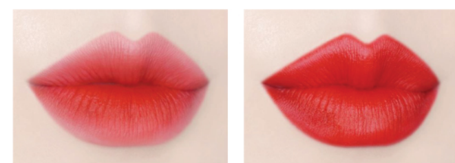
# BLIND KISS Pure red