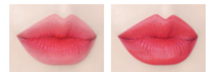
# DATE NIGHT Coral red