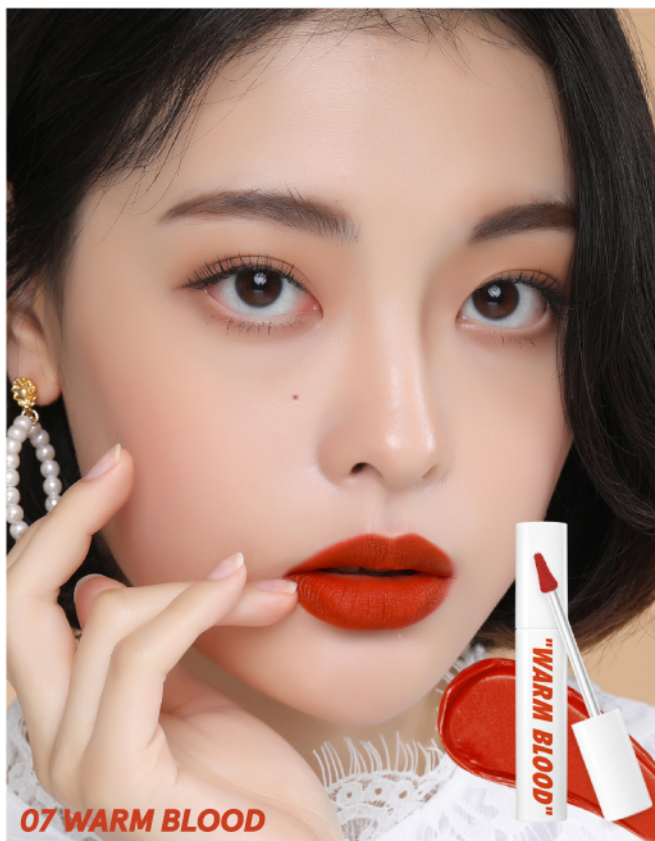
07 WARM BLOOD

Update your autumn lok with our favorite brick red.